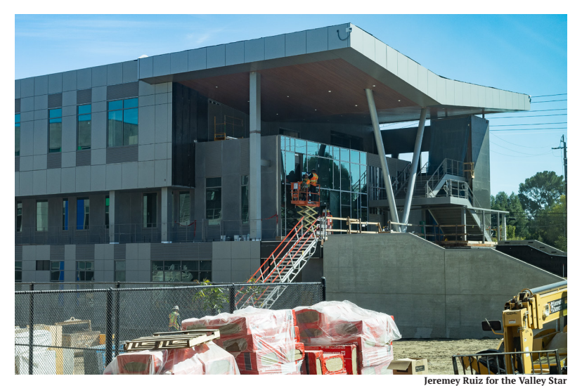
Workers install windows on Academic Complex 1, set to house multiple de partments. The building sits at Burbank Boulevard and Ethel Avenue.