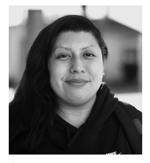
"I am more aware and take more time to do research. I try not to get my information off of social media and more from journals and articles that are peer-reviewed.'