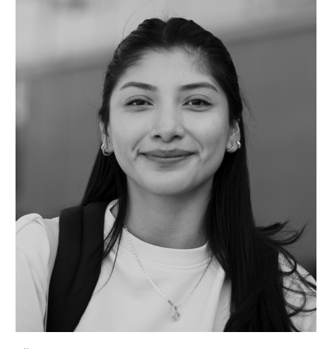
"I am skeptical of a lot of it, and I think that everything online now is fake and you really have to go online and do your own research. I feel like a lot of articles are one-sided and I like to check different articles to confirm they all have the same information.'