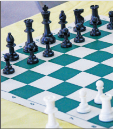
A paper chess board and pieces bought by the ASU for Chess Game Night. $2200 was spent on all new chess supplies, including chess clocks for timed matches.