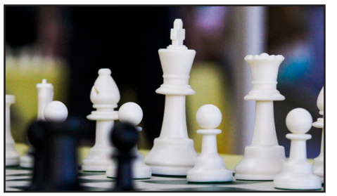
GALLERY: CASUAL CHESS ASU MADE MOVES AND ORGANIZED FALL'S FIRST CASUAL CHESS TOURNAMENT.