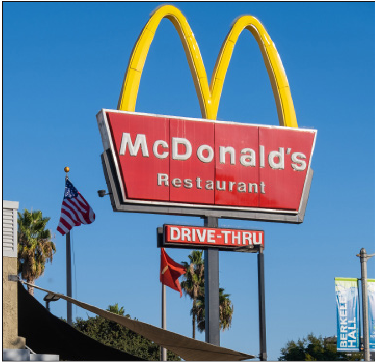
GRIFFIN O'ROURKE | VALLEY STAR

Restaurant industry rallies against California fast food workers’ collective bargaining council.