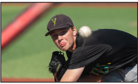
SPORTS: PITCHER RELAY MONARCH COACHES LET THEIR PITCHERS LOOSE TO SEE WHAT THEY COULD DO.