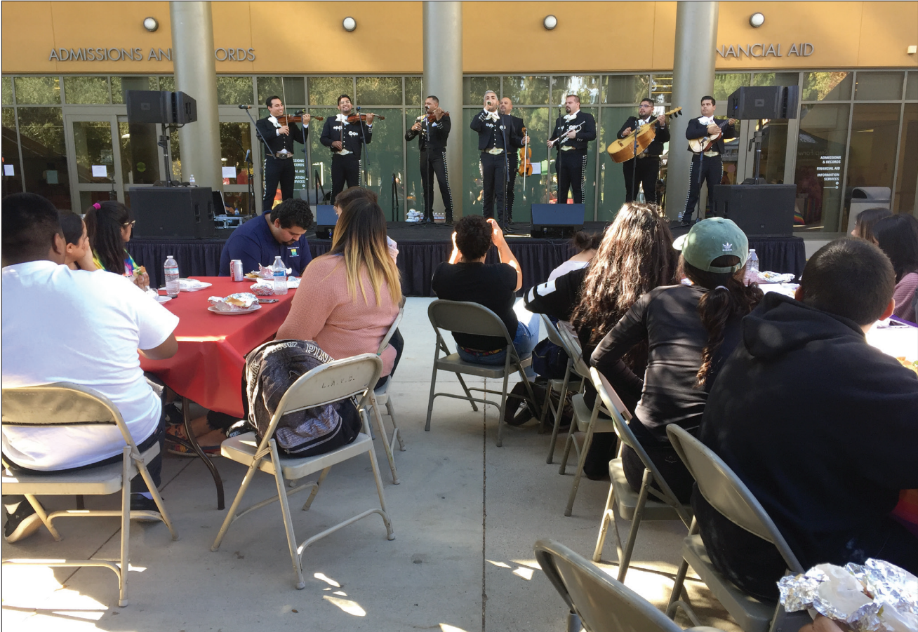
MARIACHI- The world's first LGBTQ+ mariachi band, Mariachi Arcoiris de Los Angeles, performing at Valley.