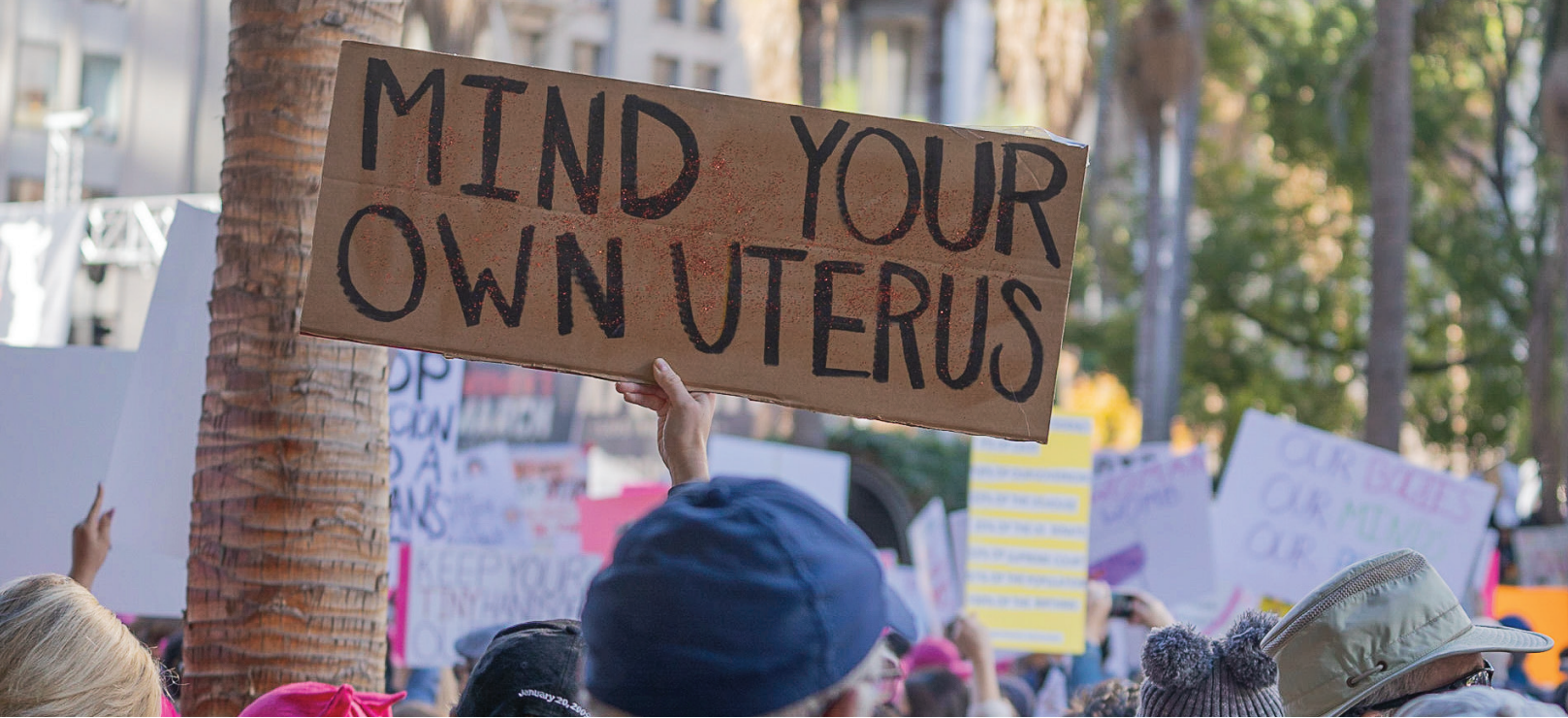
PROTEST- Protester holds up sign at the Women’s March in Los Angeles.

Republicans don’t care about children – they just want to control women.