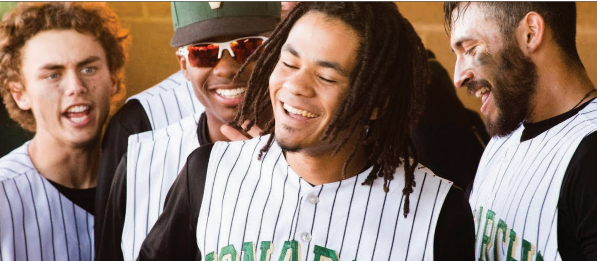
MONARCHS - The Monarchs remain in high spirits even after their 10-game losing streak, they hope to come back stronger next season.

The baseball team finds meaning in “meaningless games” to finish the season off strong and look forward to the next.