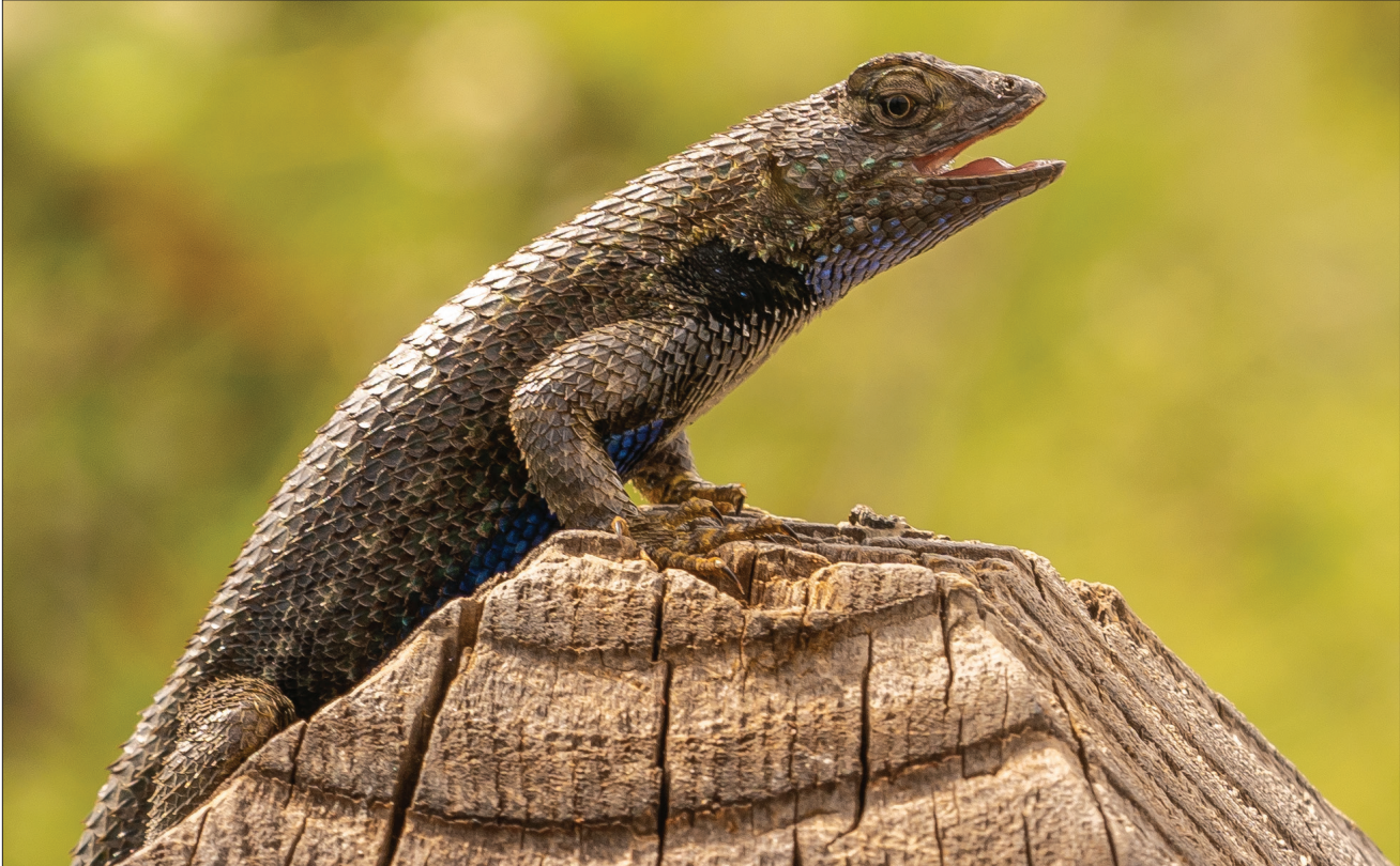
LIZARD- Desert reptile basks in the sun on a post near a field of bush daises.