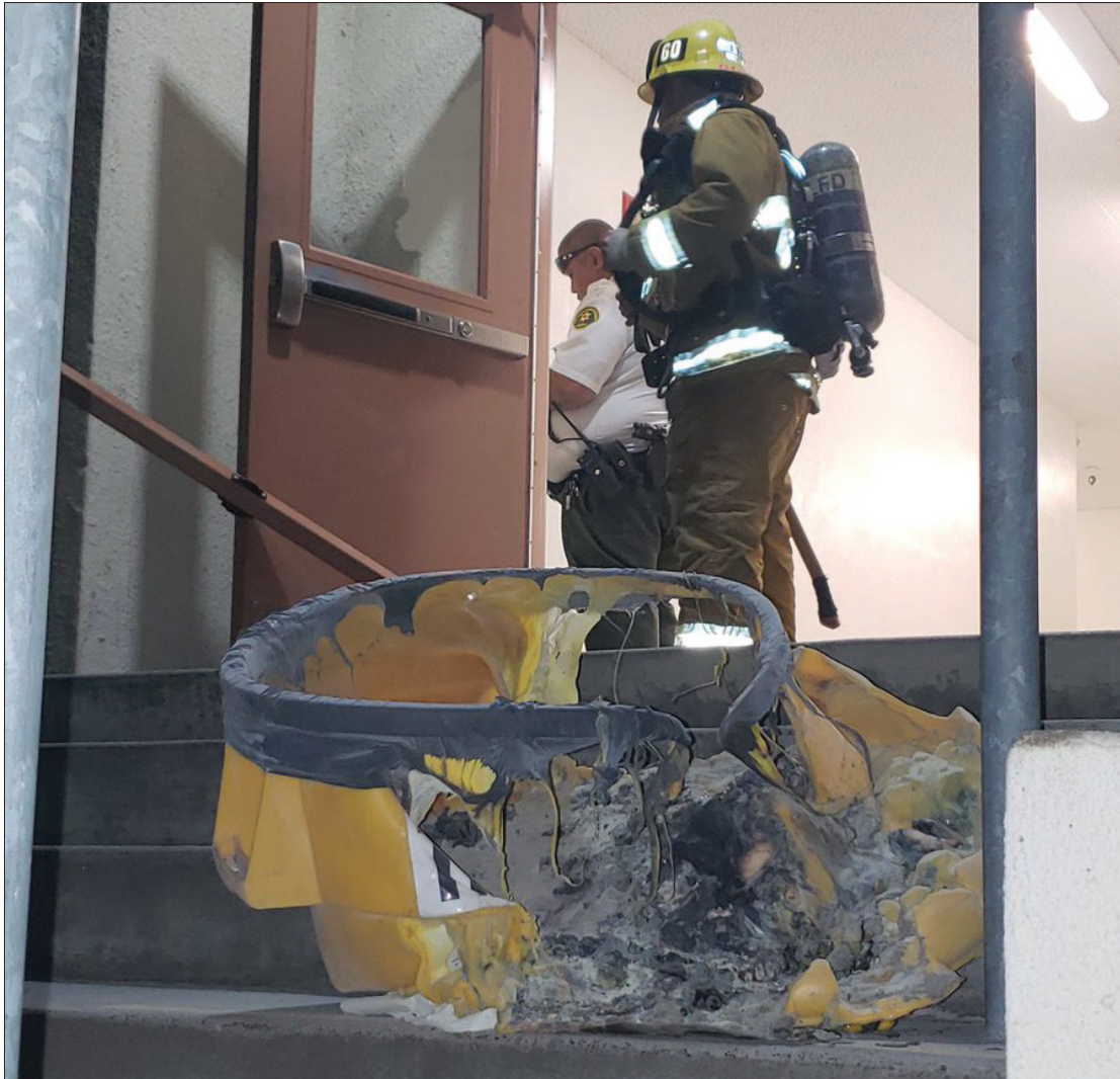
FIRE- A trash can in the Humanities Building caught on fire late in February.