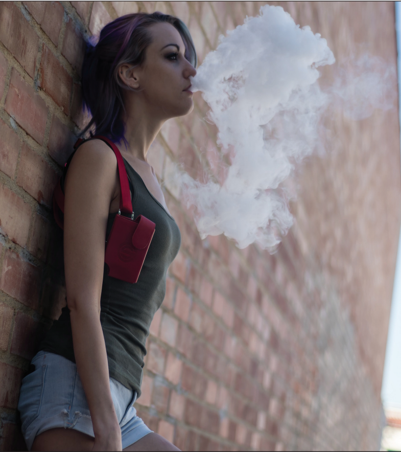
VAPING- All forms of smoking will be banned on campus.

Smoking on campus, including vaping and marijuana use, will soon be a thing of the past.